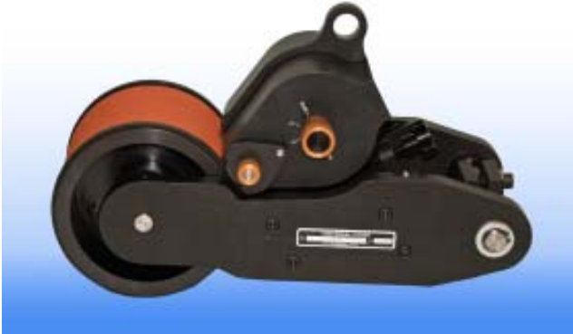
Model Shown: WPNP-400NI

The WPNP-400NI Non-Porous Web Printers meet the requirements for printing large text messages and logos on continuous web materials. Disposable Type MT Ink Rolls provide fast drying, permanent marks on plastic films, metal, rubber and glass materials.