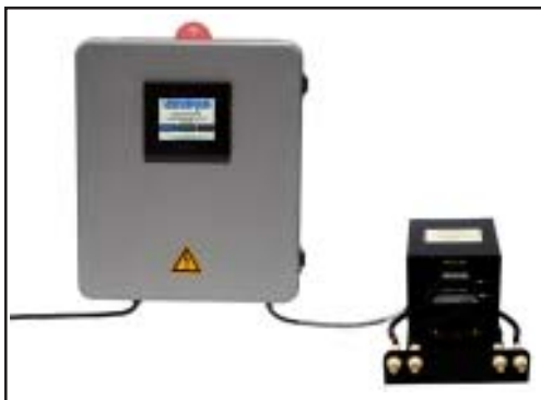
Model Shown: PIDS-200

The PIDS systems uses positive displacement peristaltic pump heads to move ink through progressive waves of contraction and relaxation of a resilient pump tube. The ink never touches any of the pumps component parts so maintenance is limited to replacing the pump tube after approximately 1,000 hours of operation. Universal's quick disconnect replacement pump tube assembly, facilitates pump tube changes in less than 10 seconds. This design provides instantaneous coder response, ensures uniform print density over the full print width of the coder at an affordable cost!