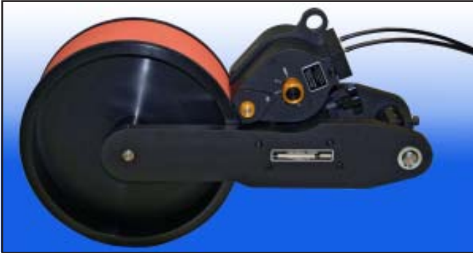
Model Shown: WPNP-400NI-12-PIDS-D

U.S. PATENT NO. 5,109,769 E.P. PATENT NO. 0508971